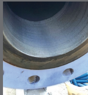
Meter Tube AFTER Restoration