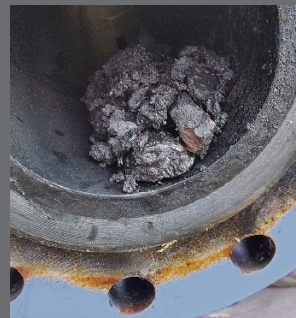
Meter Tube BEFORE Restoration