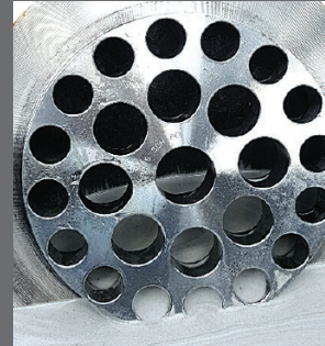
Flow Conditioner AFTER Restoration