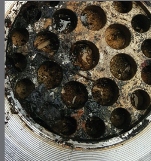
Flow Conditioner BEFORE Restoration